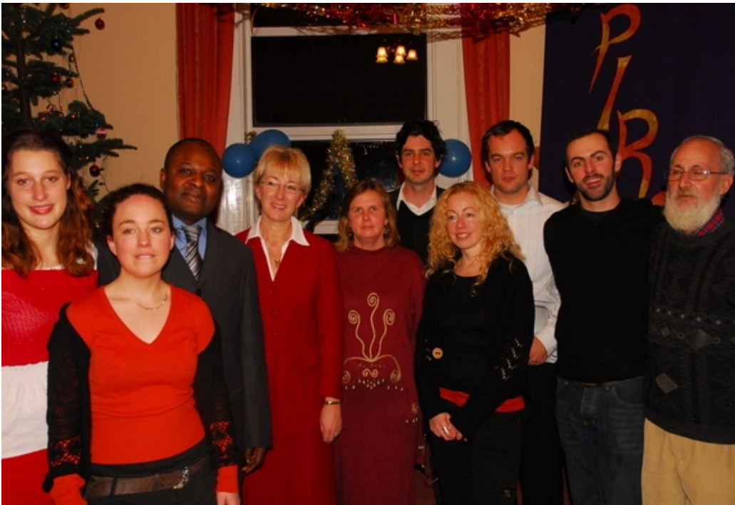
CEIM Staff with Mary Hanafin at Graduation Ceremony

The Minister also mentioned that in many of the different nationalities and faces there can be loneliness, isolation. "People are cut off from family, from the world of work, from the culture and conversation that goes on in society. But the rest of Ireland is not going to learn your language. That is also why it is so wonderful that you are learning and upskilling all the time. Any certificate in education is an achievement. In your case, it is more than a certificate. You are opening doors- to education and to society. Your own cultural background is opening too." The minister concluded with the following perceptive comment, "You are taking steps toward inclusion and involvement in society, helping your families, yourself, your children and the wider Irish society. This certificate is only one step. But it is a lot more too. The great thing about education is that it never stops. And the great thing about FETAC is that you can keep working up."